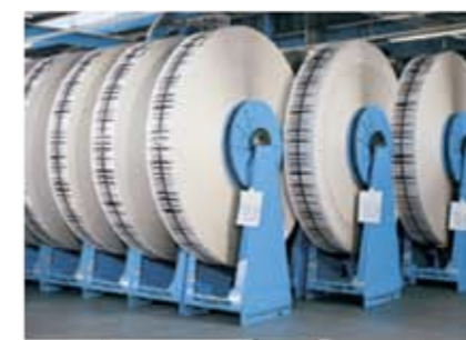
Work-In-Process & Print Reel Movement