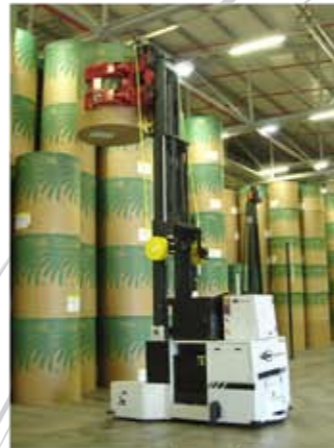
Roll Storage & Retrieval in the Warehouse