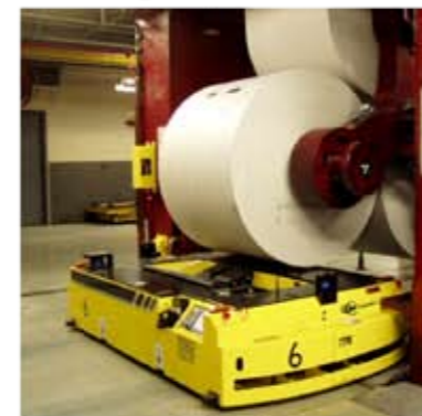
Roll Delivery and Loading at Reelstands