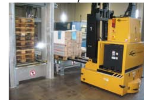
Pallet Handling in Storage & Packaging Areas