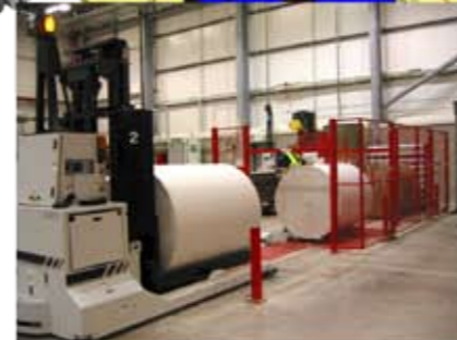
Roll Delivery & Retrieval to/from Prep Stations