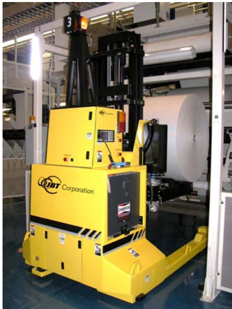
SGV loading the press