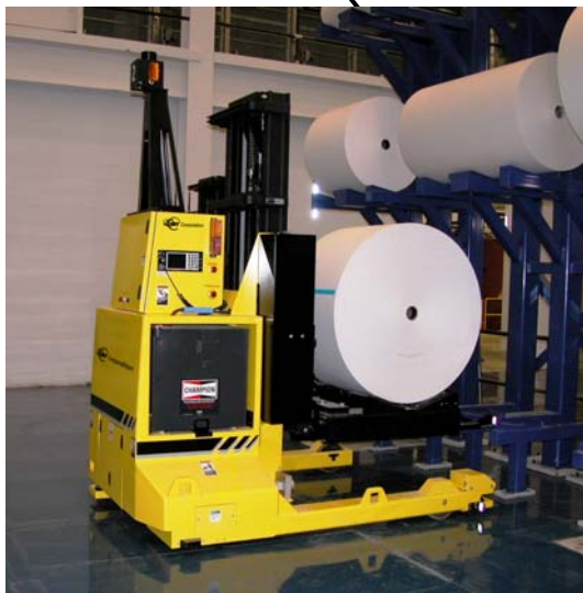
Vehicle delivering prepped roll to lay down racking