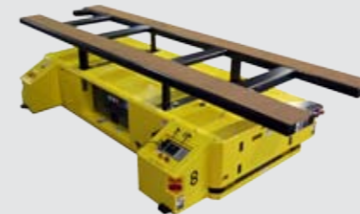
Lift Deck (Kitchen Appliances)