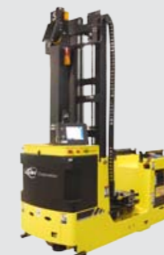
Telescoping Lift Platen