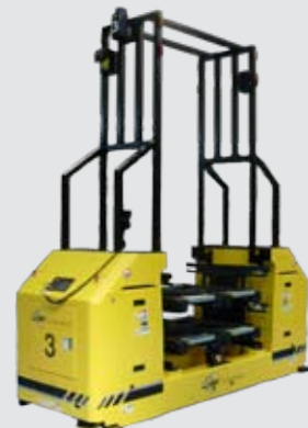
Dual Conveyor Deck