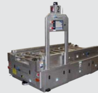
Automatic Batch Retort