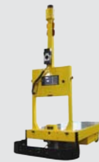
Self Guided Cart