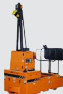
Man Aboard Tugger