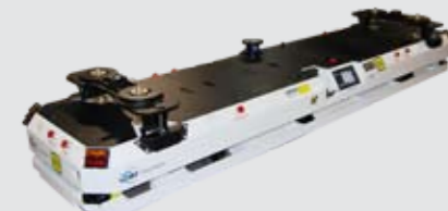
Dual Lift Deck