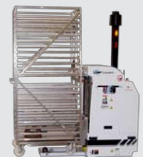
Single Fork Platen