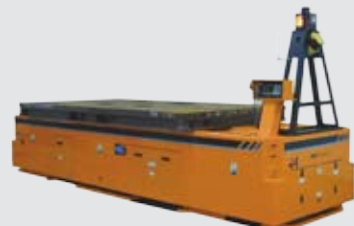
15 Ton Capacity Unit Load