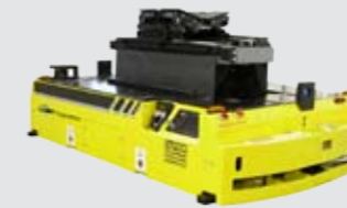
Press Delivery & Loading