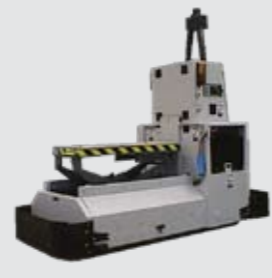
Scissor Lift Deck