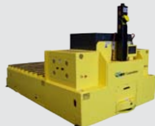
30 Ton Capacity Unit Load