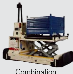
Combination Conveyor & Lift