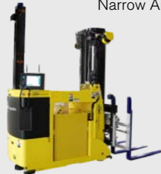
Single Double Forks