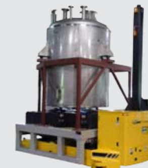
Tank Handling Fixture